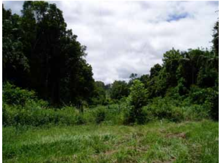
Photo L.8 LOOKING NORTH FROM THE THIRD CROSSING OF PAYNTER CREEK ALONG THE EASEMENT