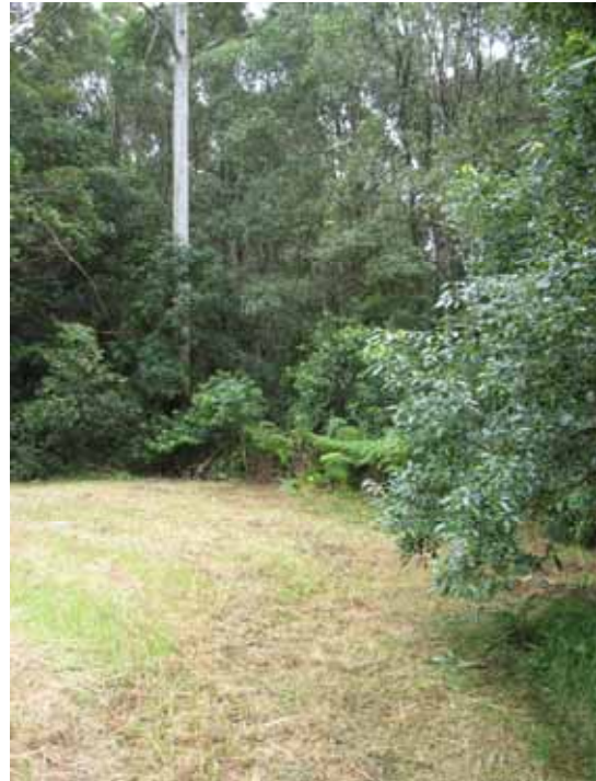
Photo L.2 VIEW TO THE WEST TOWARDS THE CROSSING POINT AT THE END OF LIANE DRIVE.