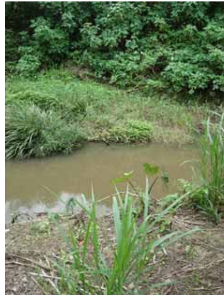
Photos L.4 and L.5 PETRIE CREEK LOOKING SOUTH ACROSS CROSSING POINT