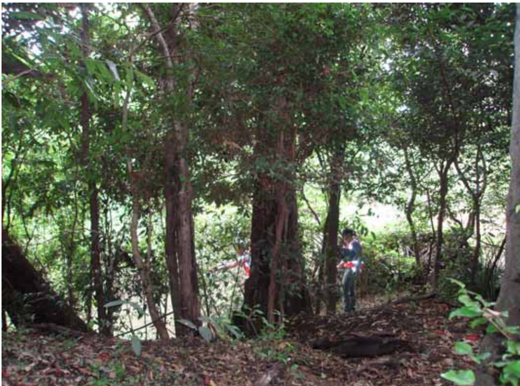
Photo L.6 NORTH BANK OF PETRIE CREEK, AT THE CROSSING POINT, LOOKING SOUTH