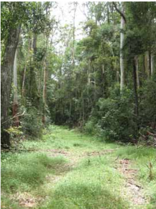
Photo L.3 EXISTING PIPELINE EASEMENT LOOKING WEST FROM SIX MILE CREEK (LEFT BRANCH)