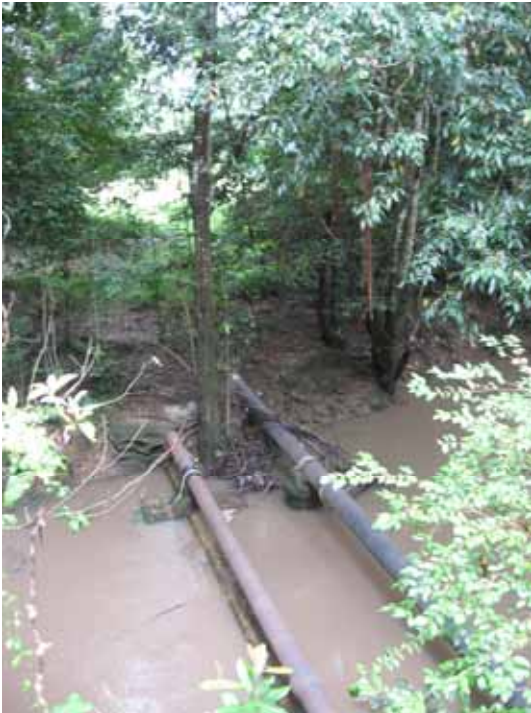
Photo L.1 PROPOSED NORTHERN CROSSING POINT AT SIX MILE CREEK (LEFT BRANCH) LOOKING EAST