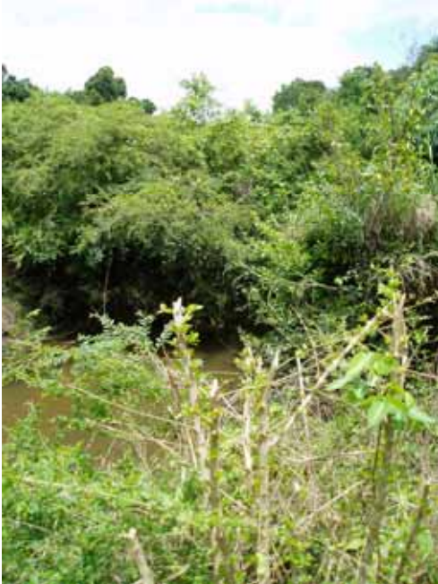
Photo L.7 LOOKING NORTH ACROSS THE FOURTH CROSSING OF PAYNTER CREEK WITHIN THE EASEMENT (NOTE WEEDY REGROWTH)